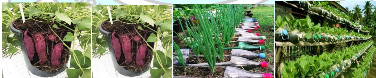
Veranda sweet potato bucket project

Under this component community member are trained on how to economically utilize their small spaces in homes to produce food and vegetables on a subsistence component. 60% of the produce is eaten at home and the 40% is sold off to sustain their feminine economic demands